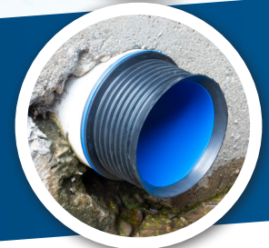
STEP 3 Push in place up to the pipe stop