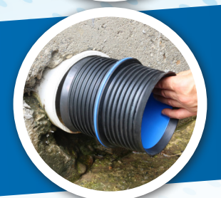
STEP 2 Lubricate gasket O.D. with soap & water solution